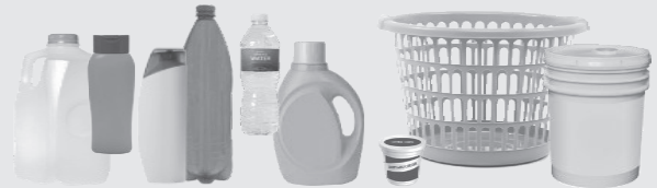
Plastic bottles, Jugs, Laundry Baskets, Yogurt cups, Kitchen & Laundry containers, 5-Gallon Pails