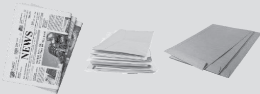
Newspapers & Inserts, Envelopes, Mail, Greeting Cards and Paper of all colors