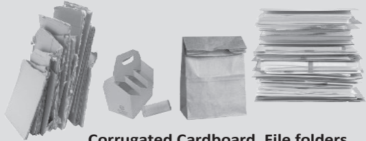
Corrugated Cardboard, File folders office paper, boxes, paper bags & drink holders

For more information, please call 845-753-2200 or visit www.rocklandgreen.com