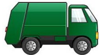
Mini - Packers