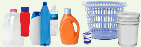
Plastic bottles, Jugs, Laundry Baskets, Yogurt Cups, Kitchen & Laundry containers, 5-Gallon Pails