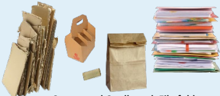
Corrugated Cardboard, File folders office paper, boxes, paper bags & drink holders

For more information, please call 845-753-2200 or visit www.rocklandgreen.com