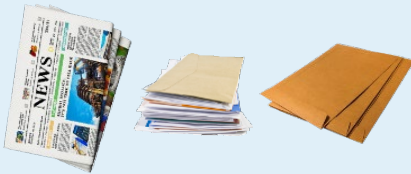
Newspapers & Inserts, Envelopes, Mail Greeting Cards, and Paper of all colors