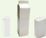
Cartons (Milk, juice & food)